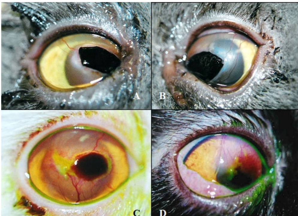
FIGURA 1. Photographic images of corneal sequestrum in a cat at initial presentation. In A and B, right and left eyes of the same animal. Note, in both, black coloration, raised, diffuse corneal edema, and neovascularization of the cornea. In C, note dense black coloration in central region of the cornea. On the temporal side of the sequestrum, there is edema of the cornea, neofomed vessels and fluorescein staining. In D, note granulation tissue close to the area of sequestrum, and corneal edema in upper and lower nasal quadrant. Note also fluorescein staining.

The corneal lesions were shown to have a circular or oval appearance, firm consistency and black coloration, and to be centrally localized on the cornea. There was conjunctival hyperemia. In four of the eyes (Figure 1) neofomed vessels were noted circumscribing the lesions to various degrees, and the stroma did not stain with the fluorescein test. 1 In one of the animals, there was granulation tissue on the cornea (Figure 1D) and dense edema circumjacent to the lesion. In this patient, the fluorescein test was positive, notably on the punctiform erosions circumjacent to the main lesion.