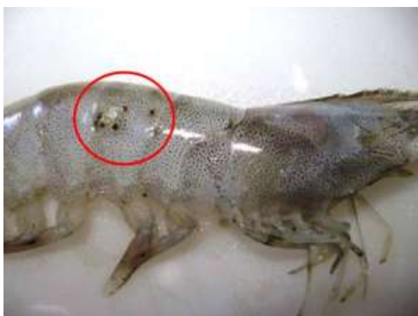
Figure 2 – Necrosis points in the abdomen of Litopenaeus vannamei .

In addition to reduced growth, deficiency of vitamin C may be responsible for physical abnormalities and deformities of the skeleton in shrimps (DESHIMARU & KUROKI, 1976; SHIGUENO & ITOH, 1988; HE & LAWRENCE, 1993), which were not observed in any specimen regardless of the treatment. However, the presence of necrosis, which is a result of enzymatic reaction due to stress situation (ABCC, 2005), was observed in all specimens, which may be related to the restriction of movement of the shrimps when kept in 1 m 3 cages, and suggests that the highest concentration of vitamin C used was not sufficient to alleviate this stress factor.