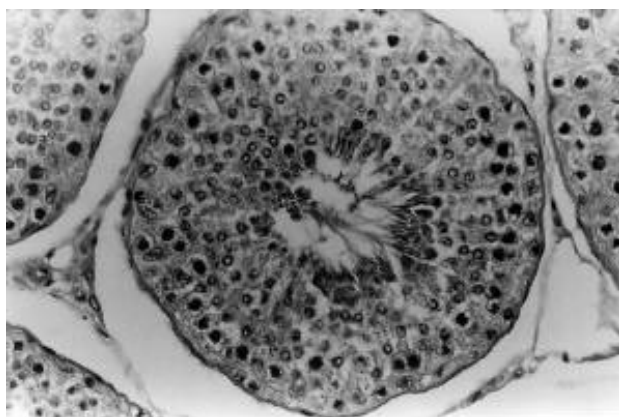
FIGURE 3. Histological section of seminiferous tubule from HPd group. 450x. Barr = 20 \mu m.