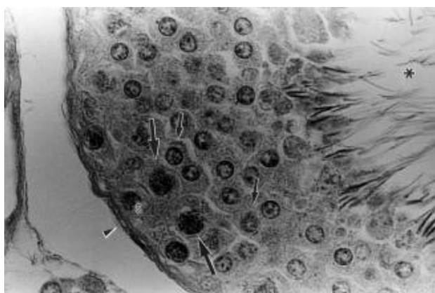
FIGURE 4. Histological section of seminiferous tubule from HPd group. Arrow-head shows the seminiferous tubule basement membrane; big arrows show spermatocytes I; small arrows show spermatocytes II; * seminiferous tubule lumen (observe spermatozoa in the lumen); S: Sertoli cell. 1100x. Barr = 10 \mu m.

The LPn group had a smaller diameter and circumference of the tubule when compared to the other treatments. Moreover, the height of the seminiferous epithelium was smaller in animals from LPn than in animals from HPd and HPn. On the other hand, the diameter and circumference of the lumen was larger in LPd compared to the other groups.