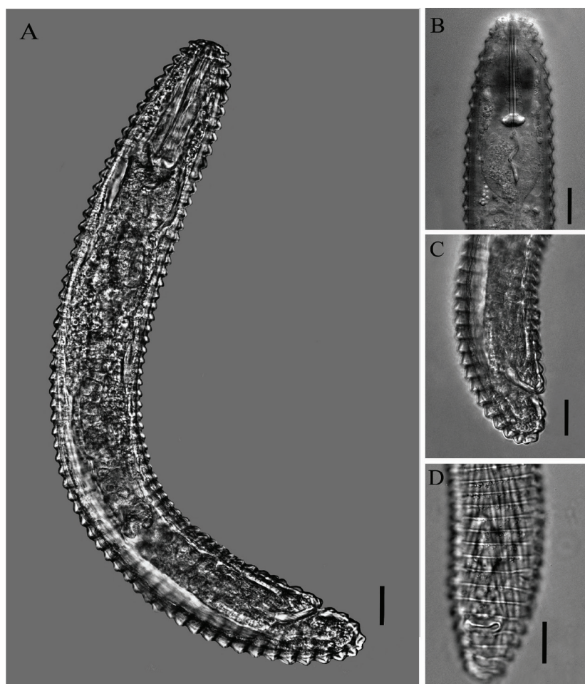
Figure 1. Micrographs of Mesocriconema sphaerocephalum (Heredia, Costa Rica, 2013). A: entire female body; B: anterior body portion showing stylet and submedian lobes; C and D: posterior portion showing vulva and tail shape. Scale bars = 20 \mu\text{m} .

Females were fixed in formaldehyde and mounted in dehydrated glycerine, and all measurements were expressed in \mu\text{m} and in the format mean \pm S.D. (standard deviation range), as it follows: n = 15; L = 342.5 \pm 33.7 (288.0-415.0); stylet length = 51.2 \pm 10.1 (31.0-70.0); a = 9.3 \pm 1.6 (6.4-12.6);