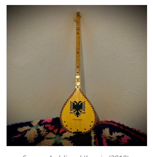
Figure 3 - String and plucked instrument (çiftelia) of the Rugova folk instrumentalists

The peculiarity of the performance of Kosovo songs in the context of oral tradition is monody, as a principle of transmission of the main musical material, characteristic of many ethnic cultures around the world. There is also an ensemble variety of vocal creativity. In this case, the singer is accompanied by one of the instruments that have become widespread in the region in question. These are localised varieties of stringed instruments (lute, çiftelia (Figure 3)) as well as wind instruments (kavalli (Figure 4)).