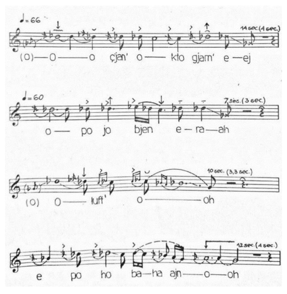
Figure 6 - "Ç'jan' k'to gjám qi po i bjen era?" (What are these echoes coming along with the wind)

Another song, "Ç'jan' k'to gjám qi po i bjen era?" (What are these echoes coming along with the wind) is an imitation of the echo in the highlands of Kosovo (Figure 6).