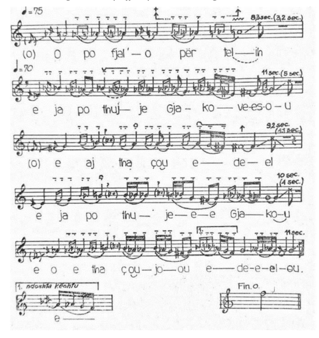
Figure 7 - "O po fjalo për tel ih" (Telegram words)