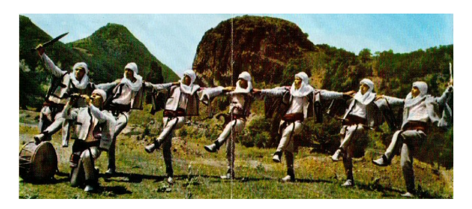
Figure 8 - "Dance of Rugova"

Folk dances of Rugova include as well as songs of this region of Kosovo, different variants of the performing composition. The most popular are collective choreographic compositions, where female and male groups of dancers perform together, as well as alternately. The subjects of the performance may differ in their orientation, genre, and style. Thus, the epic-heroic dance "Dance of Rugova" ("the dance with the sword"; "the war for the girl") is characterised by the originality and freshness of its rhythmic basis (Figure 8).