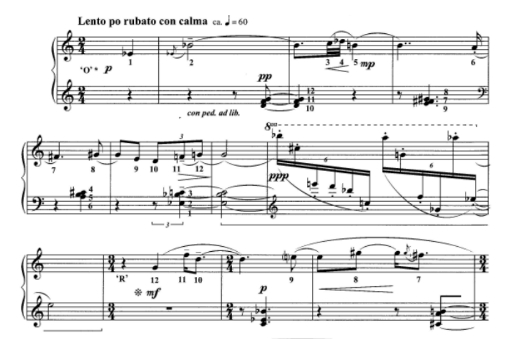
Figure 2 - An example of the sheet music for the first part of the 'Sounds of the Temple' Capriccio Suite

The second part of the suite (0.93) renders the character's inner feelings, which is achieved through emotional and rhythmic movements. This part uses polyphony with canon technique, and imitates other instruments, for example, drums, which are