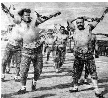
Fig 2. Athletes perform ancient sport outside of Zurkhaneh.

elements (AFSARIAN, 2016). The overall purpose of this study was to investigate the educational role of poetry and music in ancient sports.