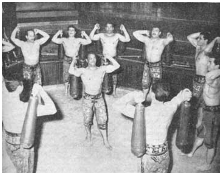
Fig 5. Athletes play to the rhythm of music