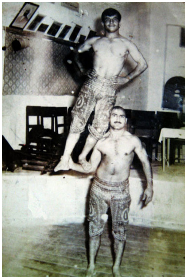
Fig 3. Athletes Gesture in front of the camera