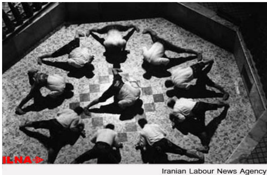
Fig 7. The harmony of the athletes play in the pit

by Tonbak. Common rhythms performed in traditional gymnasium are mainly: 6/8, 4/6, 4/4, 3/4, 2/4 (MOHSEN SHAHNAZDAR 2018).