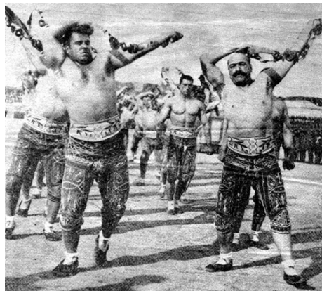
Fig 2. Athletes perform ancient sport outside of Zurkhaneh.

elements (AFSARIAN, 2016). The overall purpose of this study was to investigate the educational role of poetry and music in ancient sports.