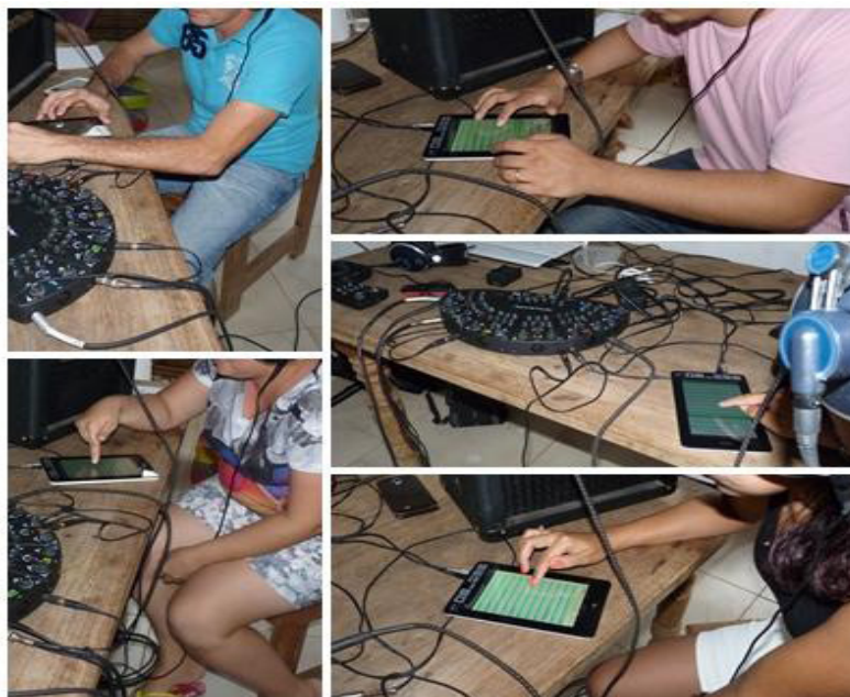
Figure 2. Subjects participating in Provocative Synthesis II at an audio and music equipment store.