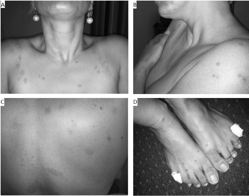
Figure 1. Erythematous, extremely itchy, papules on face, torso (A, B), back (C) and upper and lower limbs (D).