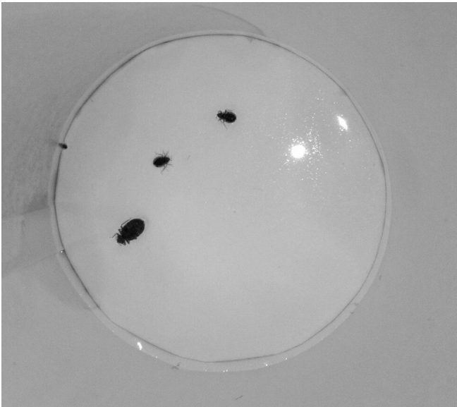
Figure 2. The patient brought us photographs of four insects that she found in her hotel bed, and which were identified as bed bugs.