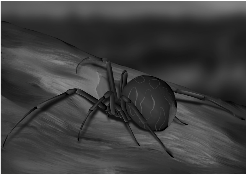
Figure 3. Latrodectus (black widow).

Image prepared by Prof. Ademir Nunes Ribeiro Júnior (FADIP).