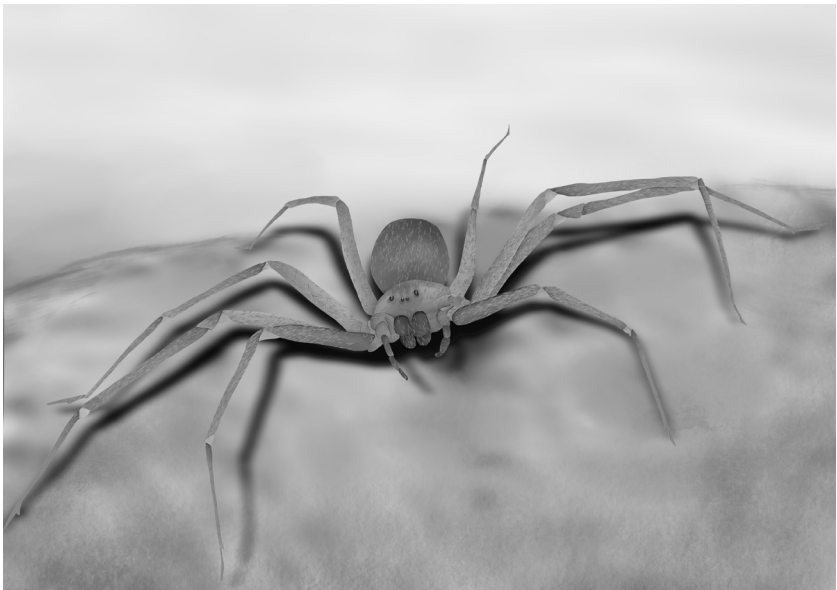
Figure 1. Loxosceles (brown spider). Image prepared by Prof. Ademir Nunes Ribeiro Júnior (FADIP).