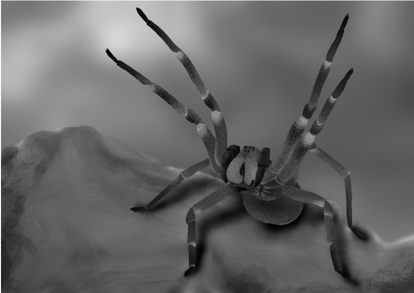
Figure 2. Phoneutria (armed spider).

Image prepared by Prof. Ademir Nunes Ribeiro Júnior (FADIP).