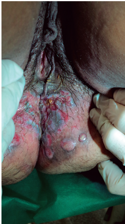
Figure 2. Genital ulcers in the perineal region