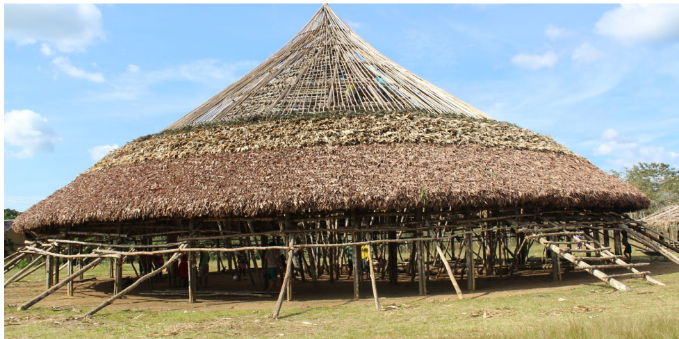
Figure 2 - Construction of the ättä, the roundhouse.