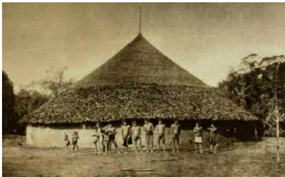
Figure 8 - Ättä, the roundhouse.

A few hours after the ademi began, Jairo, son of the leader (ayaajä) Davi, who was playing the wasaja, stopped dancing beside me, handed me the instrument and asked me to go on with the dance. I began to dance along with them, learning in practice, amid laughter and words of encouragement, to repeat the steps of the dance and beating the wasaja against the ground, strongly marking the continuous pulse of the chant. The men place their right hand over the shoulder of their partners of the same gender, and if there is a woman on their side, they dance arm in arm.