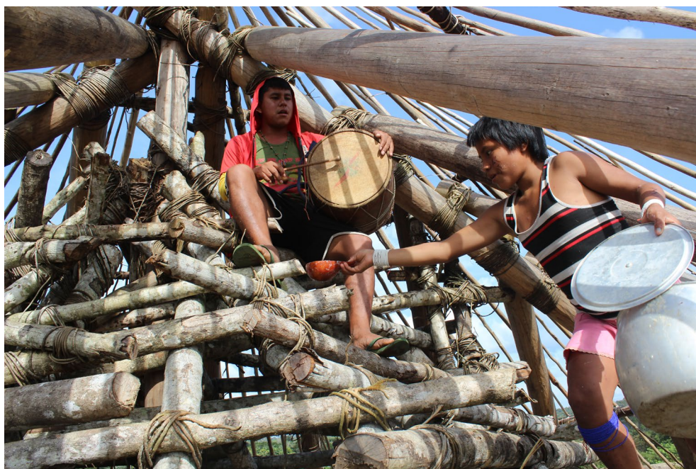
Figure 6 - Woman serves yadaake to the young man who plays the drum (samjuda) to animate community work.