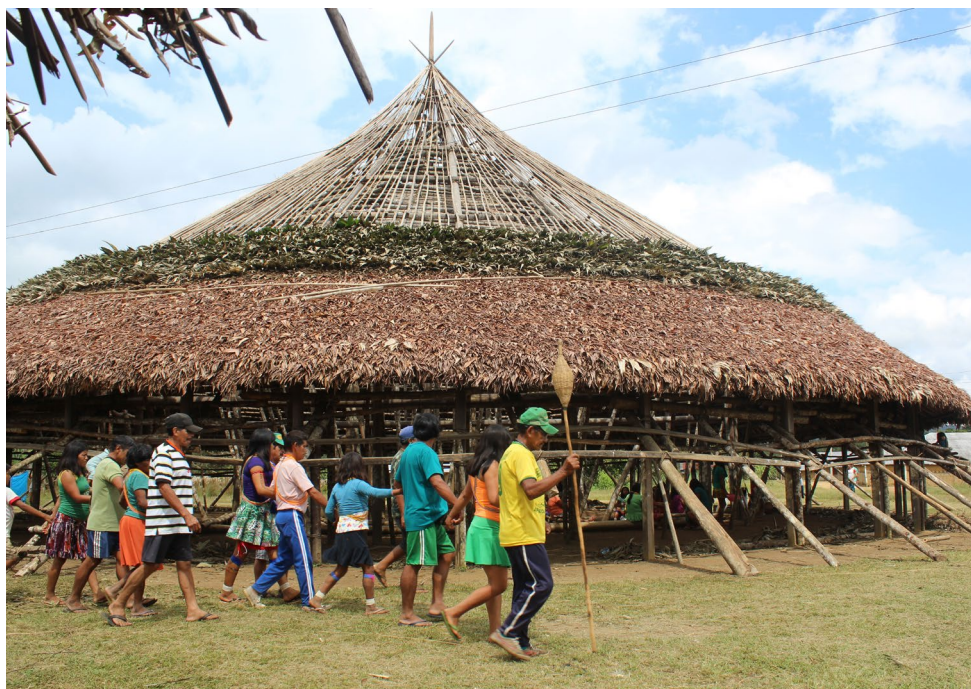
Figure 7 - Chants and dances around the round house.

animals like the piranha fish (Ka´ shai) to cut the wires of the winds, the rains, and the storms. It orders the paths of the reptiles (animals that live on the land) to be closed, it sends away the chants and songs of the Odosha birds (animals that live in the sky), and cuts off the path of the rains and storms, sonically isolating the ättä space.