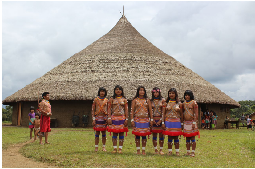
Figure 9 - Women adorned for the ättä inauguration celebration.