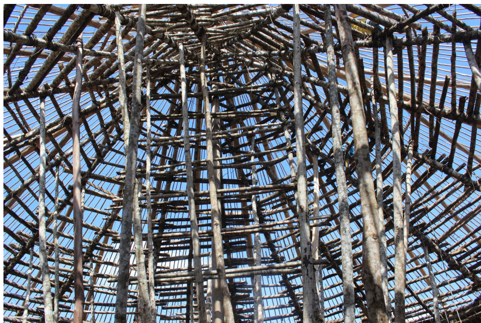
Figure 4- Scaffolding structure used in the construction of the ättä.

This cosmological and architectural model is expressed in the terminologies referring to the ättä. The outer circle (äsa), which housed the families and the domestic fire, represents the earth, the central circle (anaaka), the place of the ritual life and dormitory of the single men, corresponds to the sea (dama), and the central pole (ñududui) is the axis of the center of the earth and the connection (wadeekui) of the house with Kahuña, the center of the cosmos. The four main poles and the ñududui are the strongest and are arranged in a circle among other twelve smaller poles (iadadä), joined together by several sticks used as beams that serve as a support for the ceiling, which is constructed with many rims and sticks 11 . The cardinal points guide the places in the cosmos inhabited by the spirits, so that the more beneficial spirits live toward the east and, to a lesser extent, to the north. While the beings and spirits of Odosha live to the south and the west. That is why the most important door of the house faces the east. The roof is covered with two different types of straw, reproducing the duality of the internal division of the house.