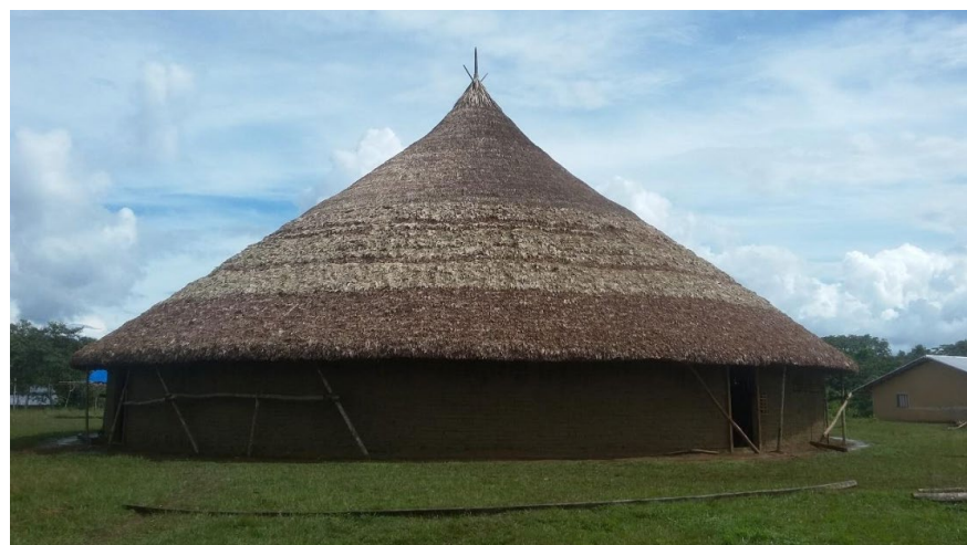
Figure 17 - Ättä, the roundhouse.