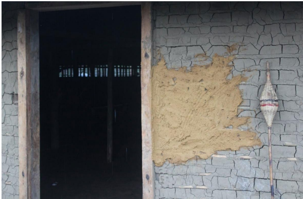
Figure 14 - Closing of the ättä.