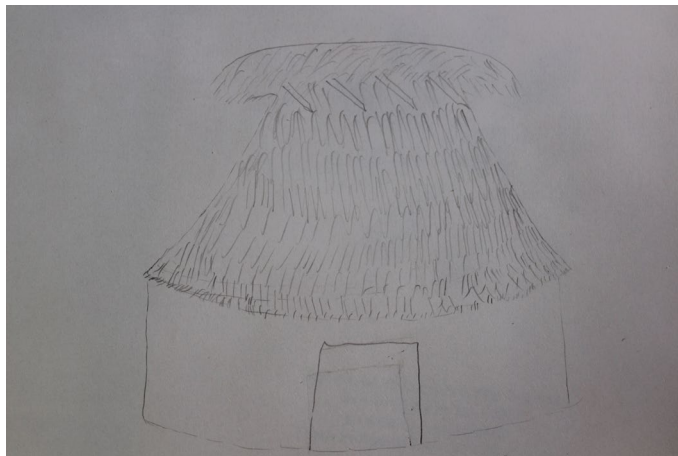
Figure 1 - Drawing of the Tuduumashaka, first house created on earth. Photo: Robélio Ye'kwana