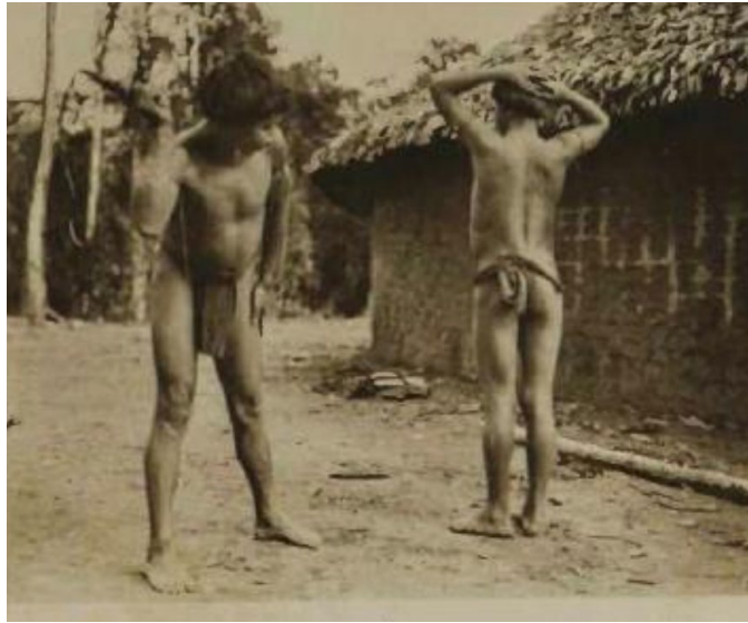
Figure 15 - Cleansing ritual with the Kudaawa plant.