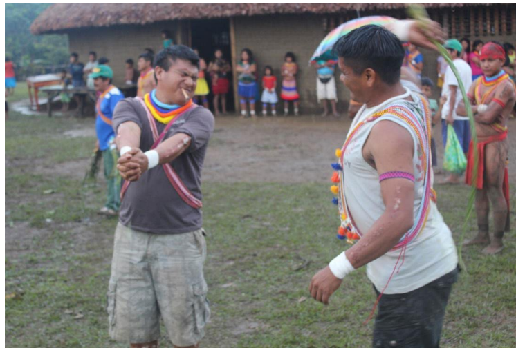
Figure 16 - Cleansing ritual with the Kudaawa plant.