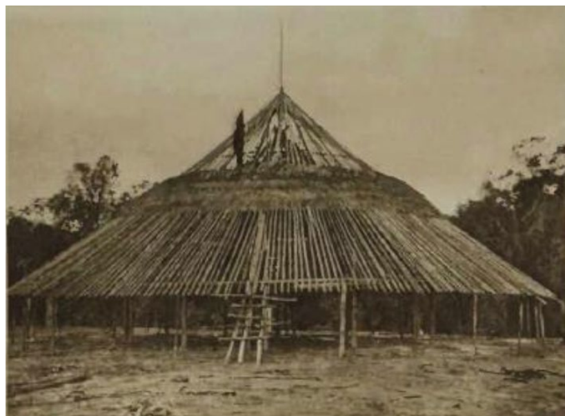
Figure 3 - Construction of the ättä, the round house.