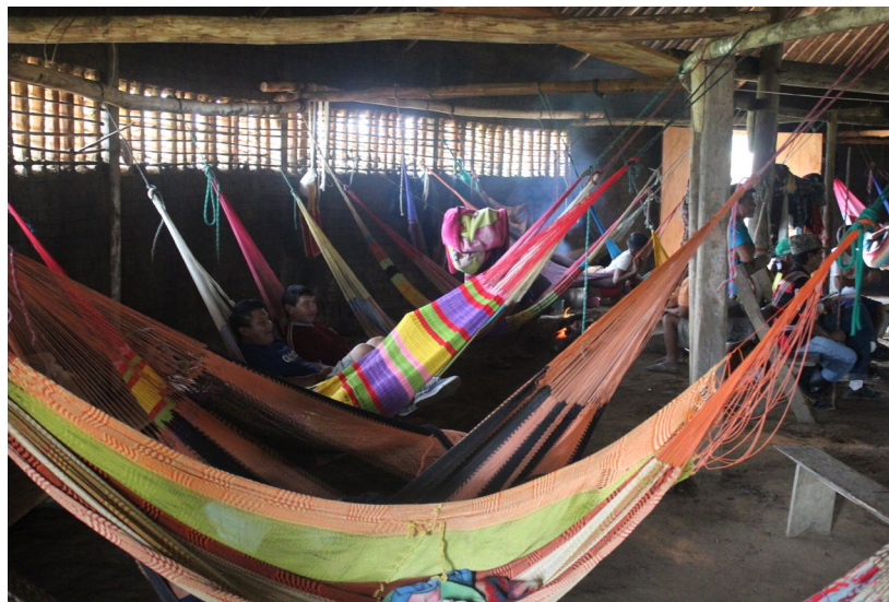
Figure 10 - Hammocks around the roundhouse.