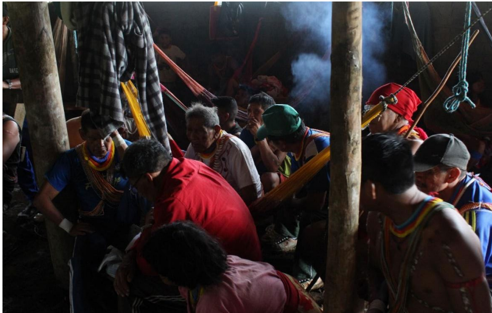
Figure 13 - Ye'kwana Inchonkomo sages.

This way, amidst the euphoria generated by the chant, the dancing and the consumption of the fermented beverage for three days, the ceremony of inauguration of the house, the ättä edemi jödö, ended.