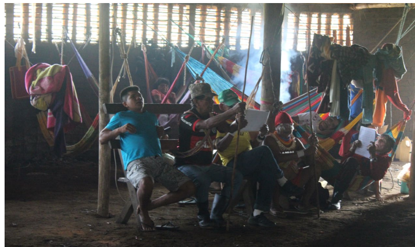
Figure 11 - The chants of inauguration of the round house.