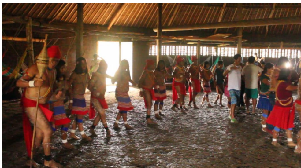
Figure 12 - Singing and dancing.

At noon of the next day, all the Ye'kwana embellished themselves following the teachings of Wanadi during the first ceremony ättä edemi jödö. The men are painted and feathered by their wives, they use their white bracelets amäkenaawono, their wo'mo and sawiia necklaces, thongs made of red cloth wayuuku, and their red cloths in the head femi. The sages Vicente Castro and Contreras show their imposing necklaces of wild pig teeth. The women wear their thongs muwaaju, their necklaces wo'mo tökokono and wo'mo, and go to the center of the anaaka for the collective dance. With the sound of the wasaja and the verses sung by the a'chudi edamo and repeated by all, they dance, adorned, in a spectacle of beauty and vitality.