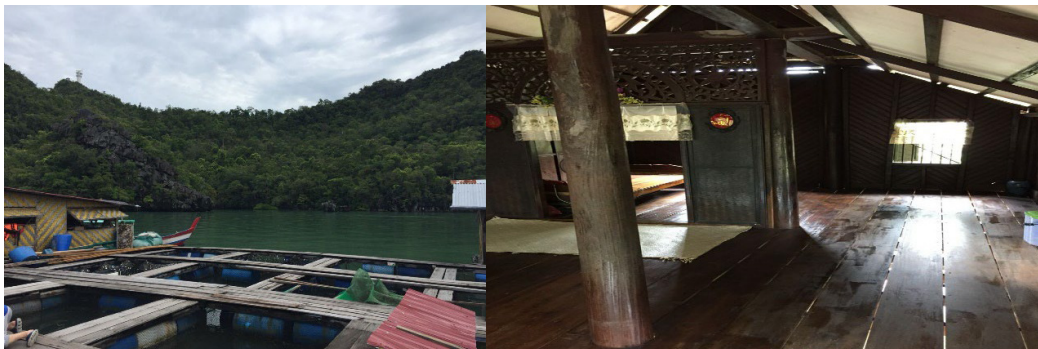
Figure 5 - Locals work as a fisherman and live in wooden house