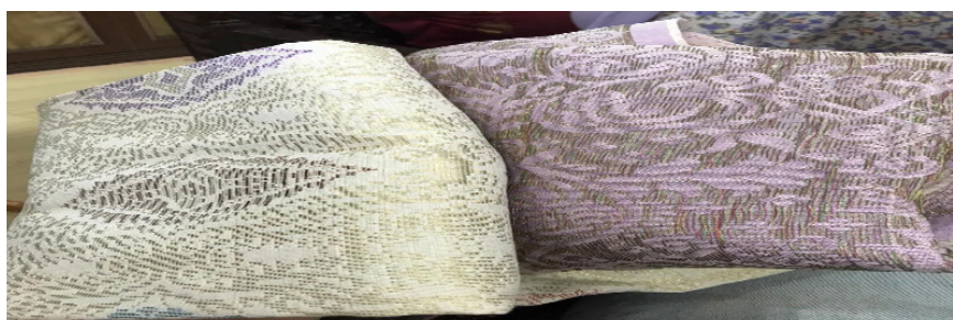
Figure 6 - Batik product crafted by batik artists