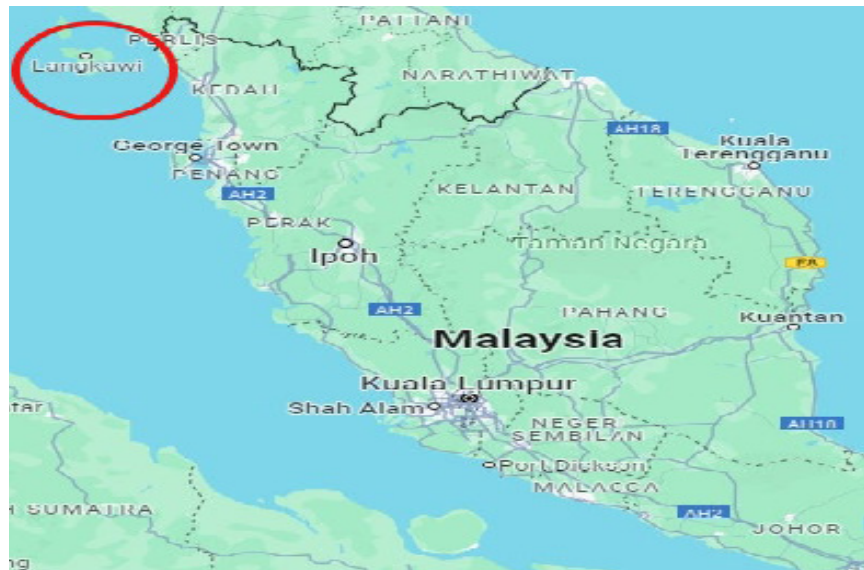
Figure 1 - Location of Langkawi Island, Malaysia in the Map