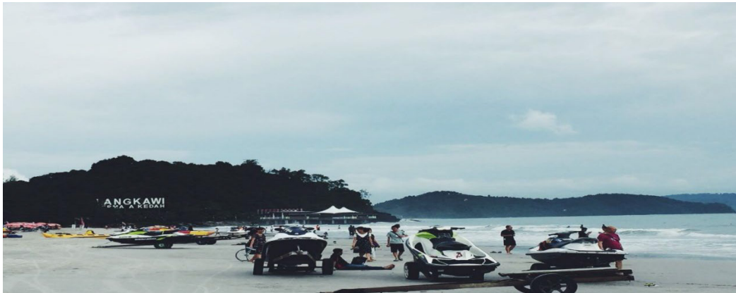
Figure 4 - Beach at Langkawi Island

community daily chores. This will be an exciting activity since many of them work as fishermen and traditional crafting. Hence, this will lead their overall evaluation of their vacation to Langkawi to be highly satisfactory and build a strong personal connection between the tourist and the island. Eventually, when the tourists start developing a strong emotional bond with the destination, they will become loyal to the destination by recommending their friends, family members, and others to visit Langkawi for a holiday.